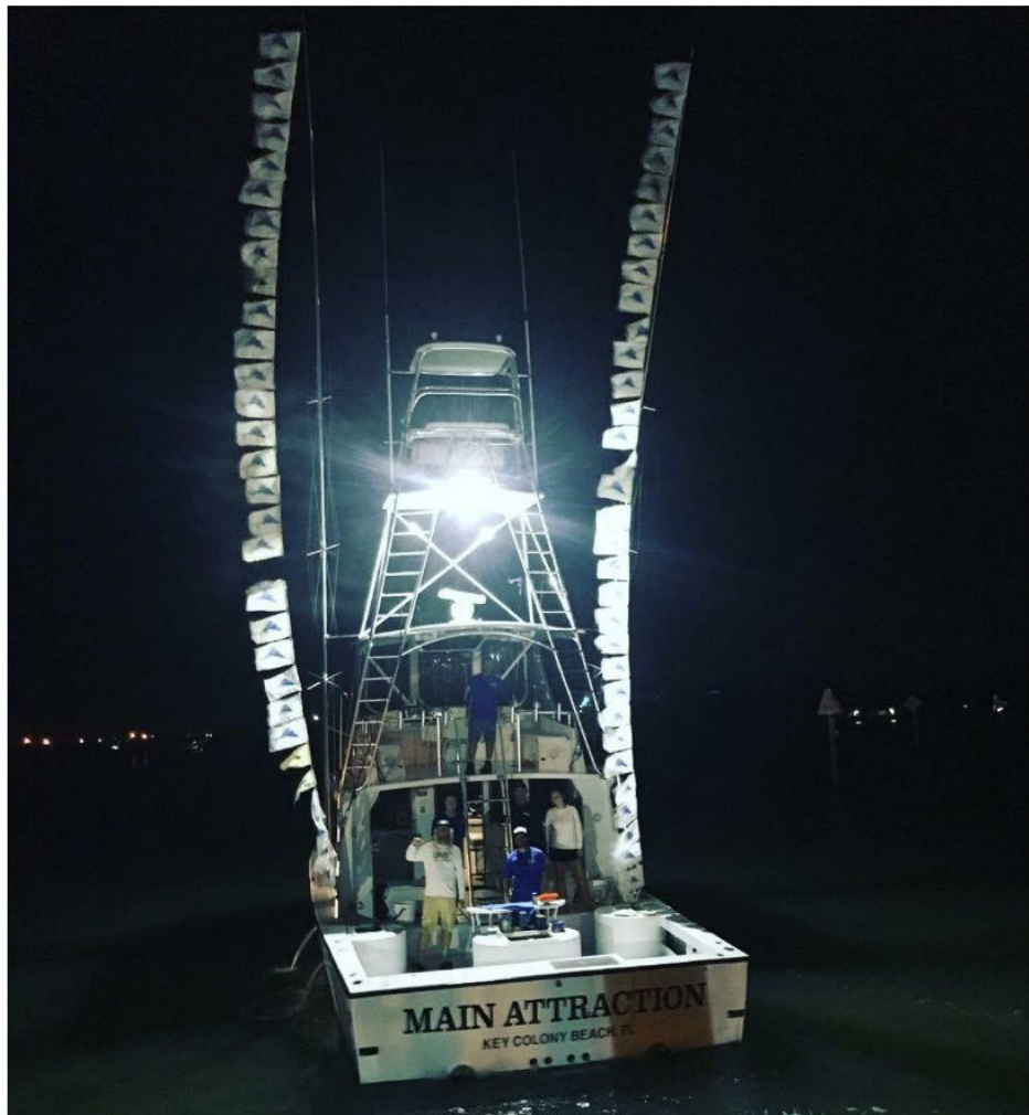
Everyone aboard the Main Attraction left with a trip to remember, plus a lot of sore muscles.

While tropical storm Alberto may be stirring up some wind and rain over Memorial Day weekend, that doesn't mean he is going to scare the fish away.