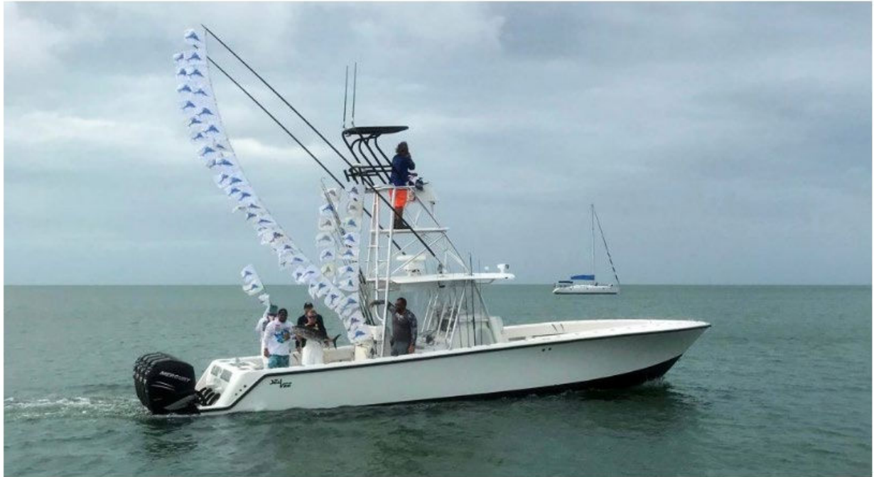
The Silent Hunter reported 65 sailfish releases and a chunky tuna to boot.

There have been some epic catches lately, including what's likely some kind of record-breaking sailfish bite off the Keys. A half-day sailfish trip off Key West resulted in a total of 61 sailfish taken on Capt. Marty Lewis' Main Attraction .