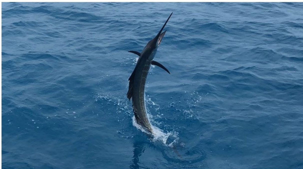
A nice action shot from the boys aboard the Main Attraction .

If you're looking to give an epic sportfishing catch to a veteran this Memorial Day, you might want to set your sights on some sails. Remember, if you are going to brave the weather this weekend, be smart, be safe and have a Happy Memorial Day!