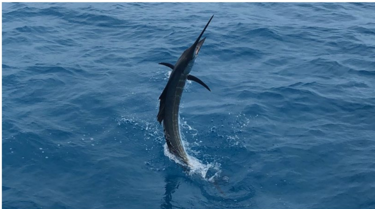
A nice action shot from the boys aboard the Main Attraction .

If you're looking to give an epic sportfishing catch to a veteran this Memorial Day, you might want to set your sights on some sails. Remember, if you are going to brave the weather this weekend, be smart, be safe and have a Happy Memorial Day!